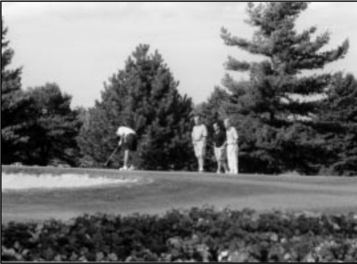
Will he make the putt?