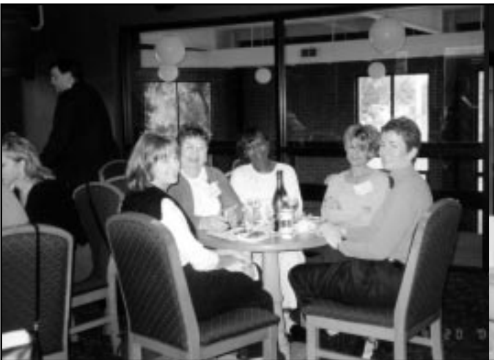
The vino was good...