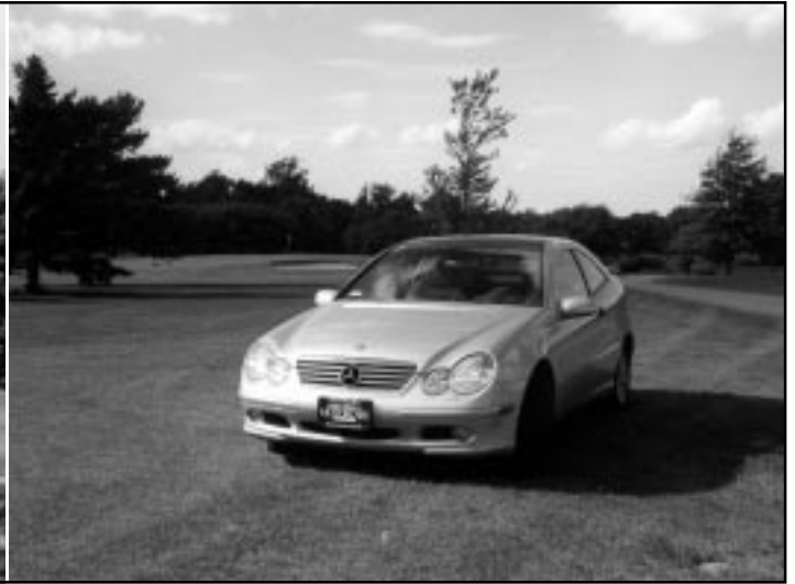
The hole-in-one prize...a Mercedes!